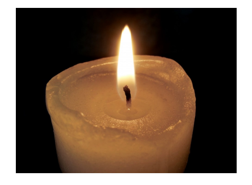
Candlelight Meal A Building March 27th